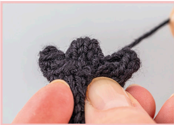
Sew the edges together.