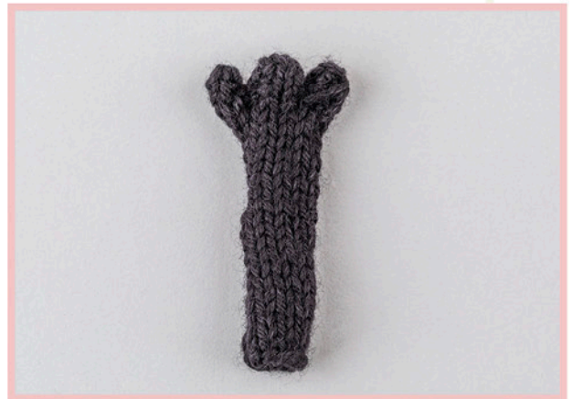
A finished hand.