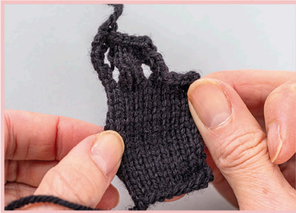
This is how the hand piece will look when knitted.