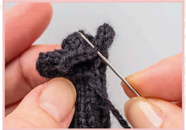
Fold the hand in half horizontally and sew the first and second cast-off edges together.